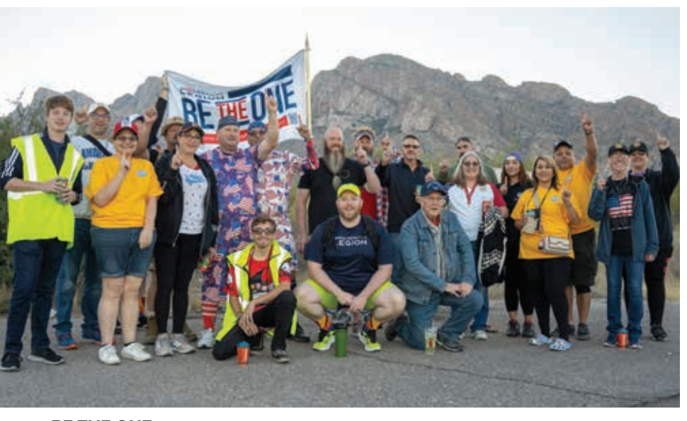
BE THE ONE : The Department of Arizona American Legion Family hosted a Be the One walk. Go to Legion.org to see a video about this project.