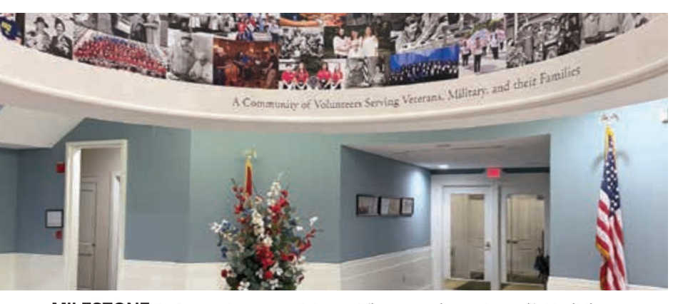
MILESTONE: In December, we celebrated five years in our beautiful building.

The American Legion Auxiliary has several levels, not just related to our officer titles or a ranking per se, but how our organization is structured. The most basic way to lay it out: unit (local community); district/county (groupings of these communities); department (state); division (groupings of states); and national (the whole). Within each of these levels is an organization