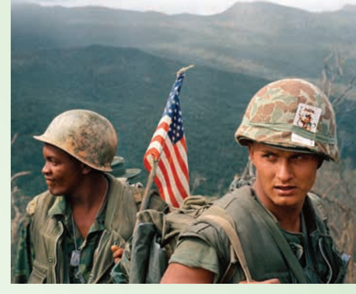
LANDING IN WAR ZONE: Marines unloading and moving through a tree and branch strewn landing zone on Dec. 17, 1969.

While herbicides containing dioxin were banned for use by the U.S. Department of Agriculture in 1968, spraying of Agent Orange continues in Vietnam until 1971.