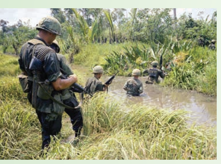
VIETNAM WAR: Vietnamese troops of the 7th Division and U.S. 9th Division were on their first combined operation in the Mekong Delta. The allied forces landed by helicopters in the marshy, canal-laced paddy country 35 miles southwest of Saigon near ap Bac. In this photo, American infantrymen of the 5th Battallion/60th Mechanized Infantry wade through muddy canals and swamps on April 8, 1967.